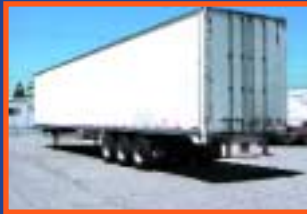
1988 ALLOY ROLLER VAN TRAILER