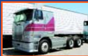
1992 VOLVO CABOVER