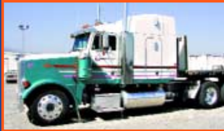
1997 PETERBILT CONVENTIONAL