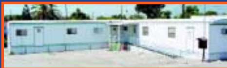
VIEW OF MOBILE OFFICES

CMA Auction Services 40 East Verdugo Avenue Burbank, CA 91502-1931