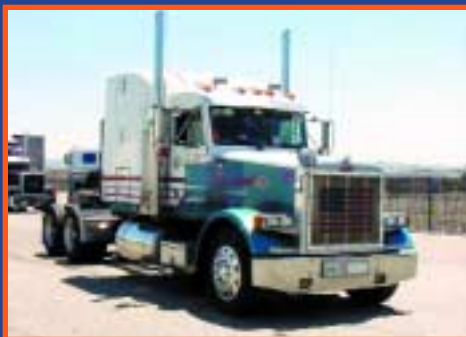
1997 PETERBILT CONVENTIONAL