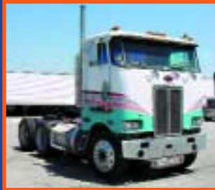
1985 PETERBILT CABOVER