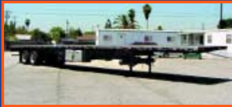
53' FLAT TRAILER