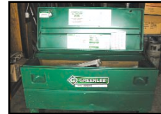
Greenlee 881CT Bender

Preview: Wednesday, May 17th, 9am-4pm & Morning of Sale