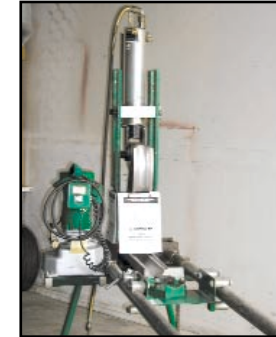
Greenlee 881CT Bender