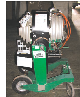
Greenlee 855 Bender