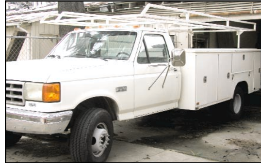
Ford Service Truck