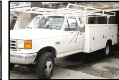
Ford Service Truck