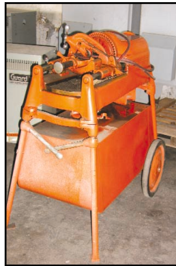
Ridgid 535 Pipe Threader