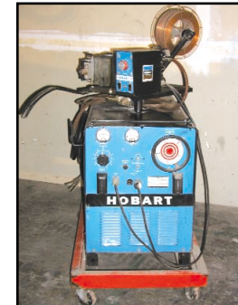
Hobart Mig Welder